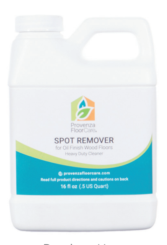
Ready to Use

Recommended for the treatment of stubborn stains or heavy duty cleaning of Provenza Oil Finish hardwood floors.